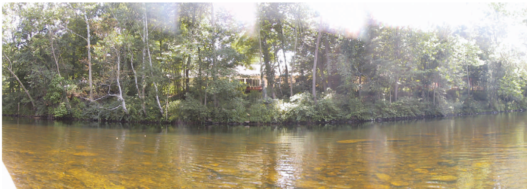
The "filtered view" of Pat's back deck and house from the river.

The Farmington River Coordinating Committee was established by the U.S. Congress to oversee and coordinate activities on the 14-mile federally designated Wild and Scenic section of the upper Farmington River. Each year the FRCC receives funding from Congress to fulfill its mandate. The Upper Farmington River Management Plan guides the actions of the Committee — and others who have an interest in stewardship of the river.